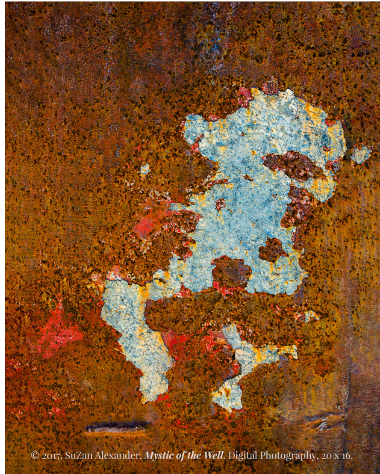
Mystic of the Well Digital Photography | 20" x 16" $675.00 (unframed) $850.00 (framed)